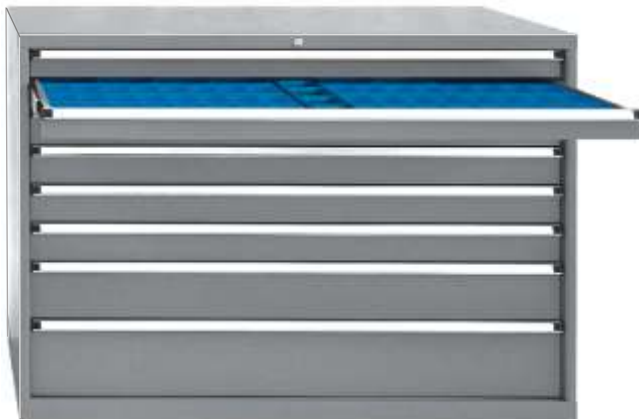
Drawer containers Used in tool cabinets