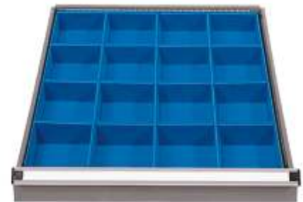
Different combination of containers in use.