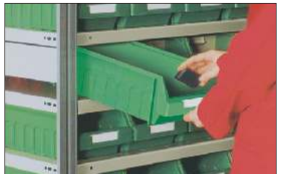
Rear lip for easy access. Stops bin from coming out.

Other useful plastic accessories to match the Supra Bins range include Bin partitions.