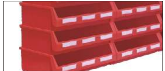
Supra bins are designed to stack one on top of each other.