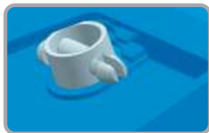
ALUMINIUM PIPE LOCK CLIP